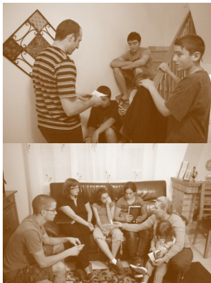
Bible Club in Sant Celoni, Spain.